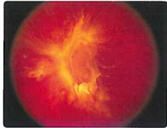
Traction retinal detachment

PDR is very serious, and can steal both your central and peripheral (side) vision.